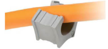
可分开穿芯 Split inserts